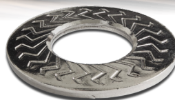
BN 208 010-8 Sperrkant washer