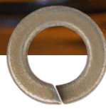
Mechanical zinc plated, yellow Cr6-free