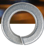
Mechanical zinc plated white