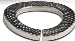
BN 208 012-6 Sperrkant spring washer